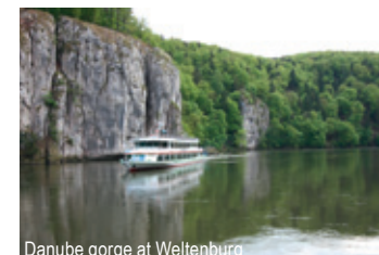
Danube gorge at Weltenburg

In July 2006 the Old Town of Regensburg and Stadthof were declared a UNESCO World Heritage Site. Till today you can see almost 2,000 years of historical development on the facades of the Old Town.